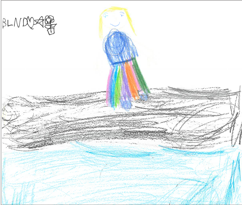
Drawing by a child of Swedish Red Cross representative by a child interviewed in Iraqi Kurdistan.